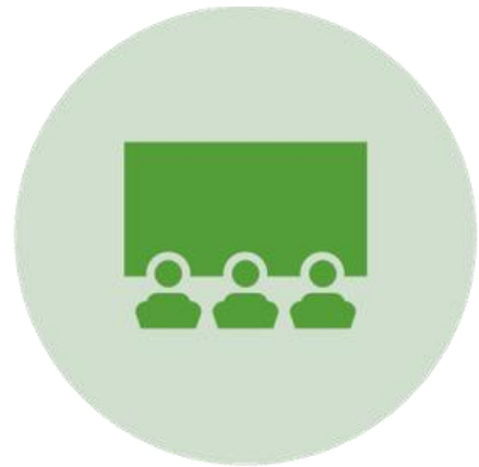
Event production / management