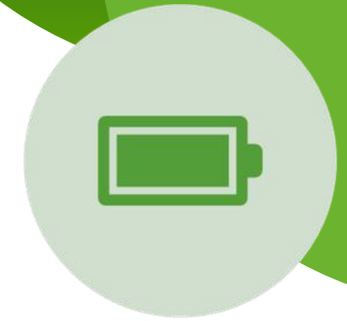
Event Power Providers