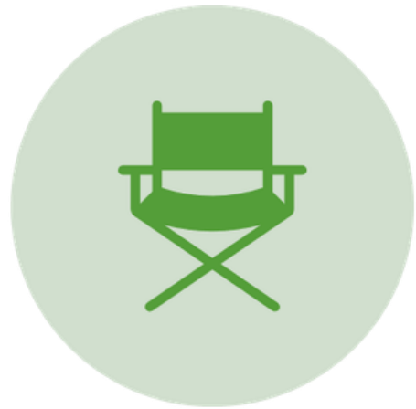
TV & Film production